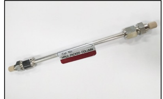
HPLC packed column.

The seal's performance was validated in lab testing and subsequent field deployment of equipment. The Chesterton Series 100 (105) – Cantilever Spring-Energized Seals successfully sealed under a high-pressure and chemically aggressive environment.